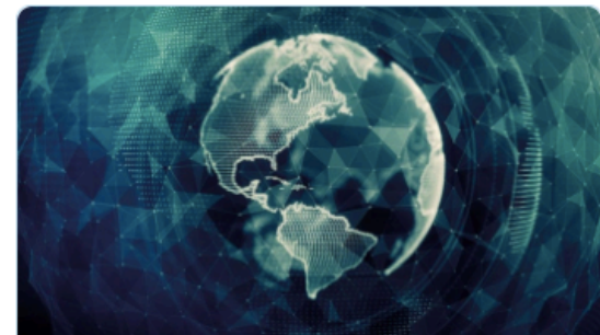
Digital Trade and Global Internet

Videos from the ICANN and USC Annenberg Spring