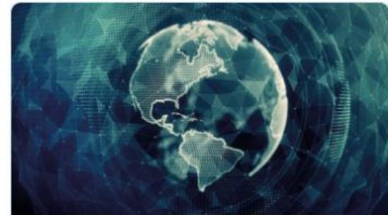
Digital Trade and Global Internet

Videos from the ICANN and USC Annenberg Spring