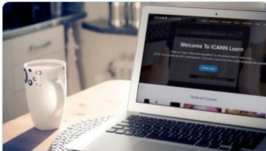
Getting Started with ICANN Learn